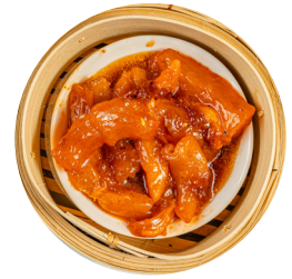
牛筋 Beef Tendon - L