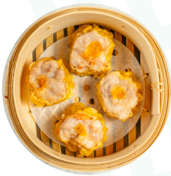
蟹皇燒賣 Pork and Prawn Siu Mai - L