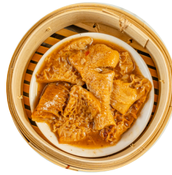
牛肚 Beef Tripe with ginger - L