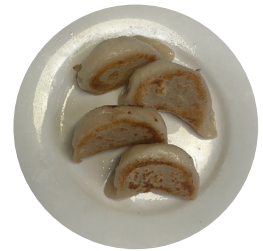
鍋貼 Pan Fried Pork Dumplings - L