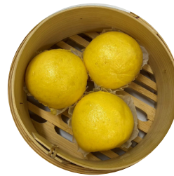
奶黃包 Custard Bun - L