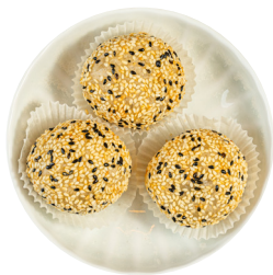
黑芝麻煎堆 Sesame Balls - M