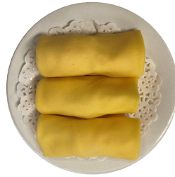
芒果班戟 Mango Pancakes - L