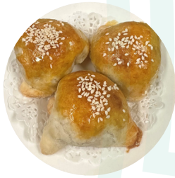
叉燒酥 Baked BBQ Pork Pastry - L