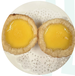
酥皮蛋撻 Egg Tarts - M