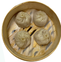
小籠湯包 Shanghai Pork Dumplings (Xiao Long Bao) - XL