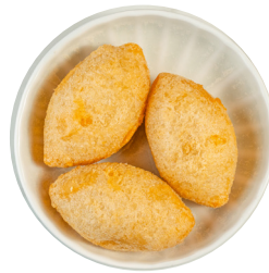
鹹水角 Deep Fried Combination Dumplings - L