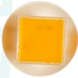
芒果布丁 Mango Pudding - M