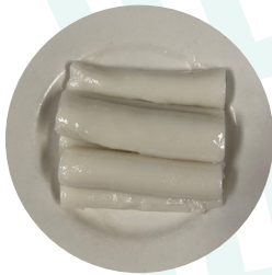
軟滑白腸粉 Plain Steamed Rice Noodle - M