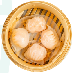
水晶鮮蝦餃 Har Gow Prawn Dumplings - XL