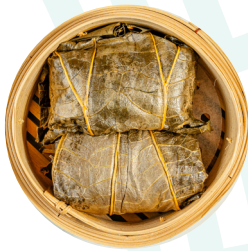
荷葉糯米雞 Sticky Rice & Pork in Lotus leaf - L