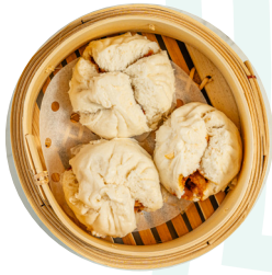
叉燒包 BBQ Pork Bun - L