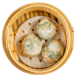
鮮蝦菠菜餃 Prawn and Spinach Dumplings - XL