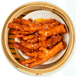
豉汁鳳爪 Chicken Feet in Black Bean sauce - M