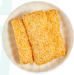
芝麻蝦卷 Sesame Prawn Rolls - XL