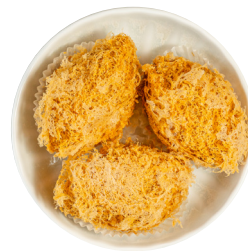
蜂巢芋角 Fried Taro Dumplings - L