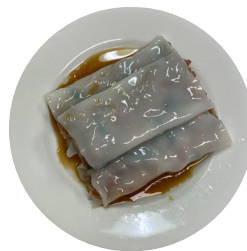
牛肉腸粉 Steamed Rice Noodle with Beef - SP