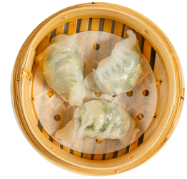
鮮蝦韭菜餃 Prawn and Chives Dumplings - XL