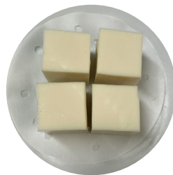
香滑椰汁糕 Coconut Jelly - S