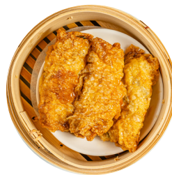
腐皮鮮竹卷 Bean Curd Roll with Chicken - L