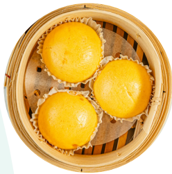
流沙包 Salty Egg Bun - L