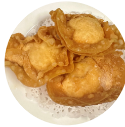
鮮蝦炸雲吞 Fried Prawn Wontons - L