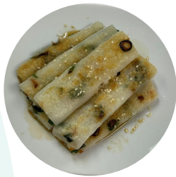
煎腸粉 Pan Fried Rice Noodle - M