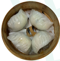
齋菜餃 Vegetarian Dumplings - M