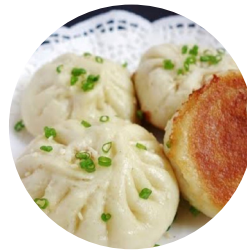
生煎包 Shanghai Pan Fried Pork Bun - XL