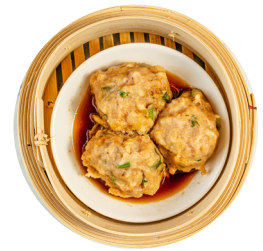
山竹牛肉 Beef Minced Ball - M