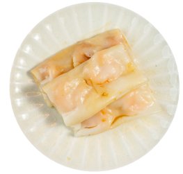
鮮蝦腸粉 Steamed Rice Noodle with Prawns - SP