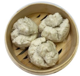
雞包 Chicken Bun - L