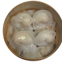
鮮蝦帶子餃 Scallop and Prawn Dumplings - XL