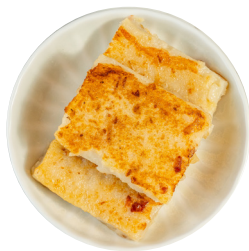
煎蘿蔔糕 Turnip Cake - L