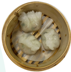
潮州粉粿 Chiu Zhao Style Dumplings - L