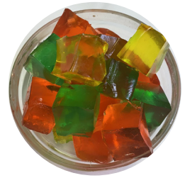
果凍 Assorted Jelly Cubes - S