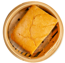
馬拉糕 Chinese Sponge Cake - M