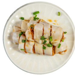
脆炸兩腸粉 Steamed Rice Noodle with Dough Fitters - SP