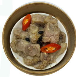
豉汁排骨 Pork Ribs in Black Bean - L